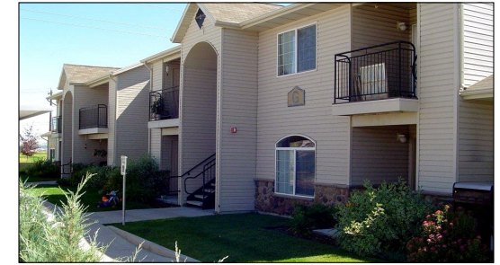
FOUR BEDROOM/TWO BATH 1200 SQFT