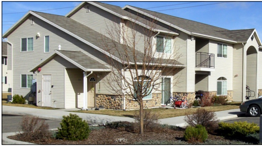
TWO BEDROOM/ONE BATH 800 SQFT